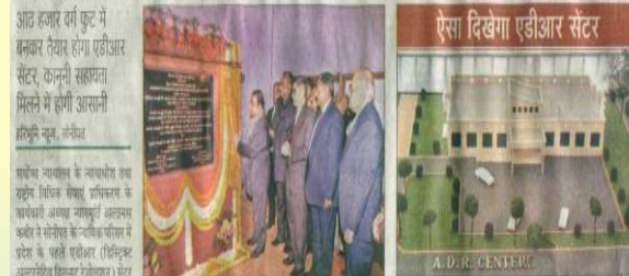
सर्वोच्च न्यायालय के न्यायाधीश ने रबी प्रदेश के पहले एडीआर सेंटर की आधारशिला रखी।

सर्वोच्च न्यायालय के न्यायाधीश ने रबी प्रदेश के पहले एडीआर सेंटर की आधारशिला रखी। सर्वोच्च न्यायालय के न्यायाधीश ने रबी प्रदेश के पहले एडीआर सेंटर की आधारशिला रखी।