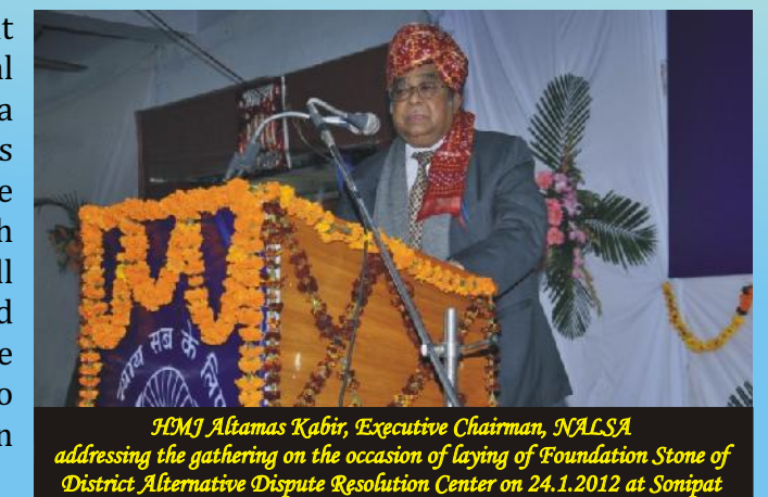
HJM Altamas Kabir, Executive Chairman, NALSA addressing the gathering on the occasion of laying of Foundation Stone of District Alternative Dispute Resolution Center on 24.1.2012 at Sonipat

the disputes can be resolved by any of the ADR processes like arbitration, conciliation, Lok Adalat or mediation. His lordship told that Haryana will soon get its first District Alternative Dispute Resolution Centre, which will help to provide quick settlements out of court, which are informal in nature. His lordship also told at length about the concept of 'Legal Aid Clinics' and the scheme of Para Legal Volunteers. He said that "As Primary Health Centres have proved beneficial to the health sector, the District ADR Centre will play an important role in legal aid and legal service sector". These centres will provide the option to parties to settle their matters in satisfactory manner.