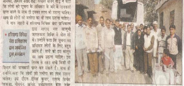
पृथला में लगा कानूनी जागरूकता शिविर।