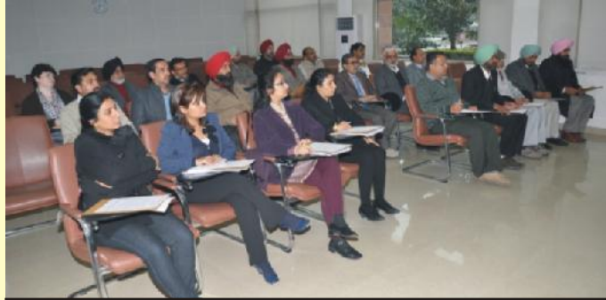
Advocates participating in Mediation Training Programme