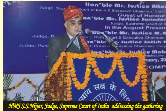
Hon'ble S.S.Nijjar, Judge, Supreme Court of India addressing the gathering

because foundation stone of first ADR Centers had been laid by Hon'ble Mr. Justice Altamas Kabir in district Sonipat.