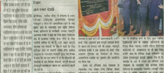
पहला एडीआर सेंटर सोनीपत में खुलेगा।

पहल सोनीपत में खुलेगा प्रदेश का पहला एडीआर सेंटर। पहला एडीआर सेंटर सोनीपत में खुलेगा।